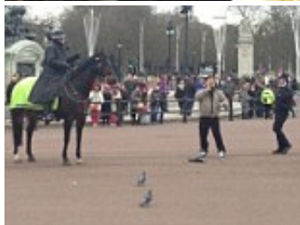
Shocking footage shows man holding huge knife to his throat...