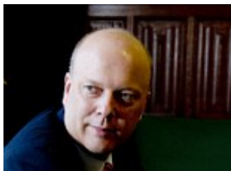
Criminals face new 'spartan prisons': Justice...