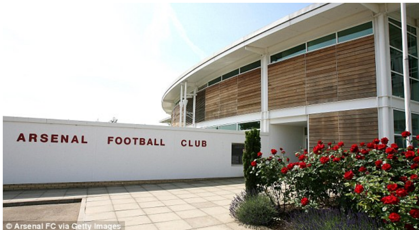
Behind the scenes: A fan was given a tour of the training complex, apparently by the club doctor

More damaging for the club, though, was the image of the manager's office and desk, as well as a snap of the whiteboard which revealed German star Lukas Podolski would not feature in Sunday's game at Chelsea.