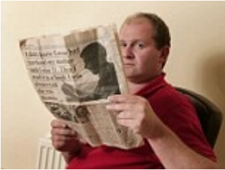
• Brother 'claims Lucan escaped to Africa and died in 2004':...