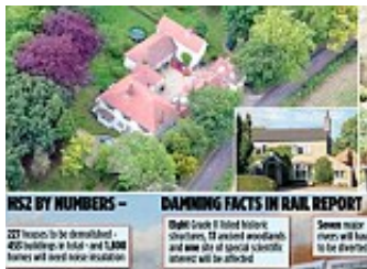
The great HS2 housing crash: Savage toll on home sales...