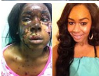
Victoria's Secret worker scarred for life when niqab-wearing...