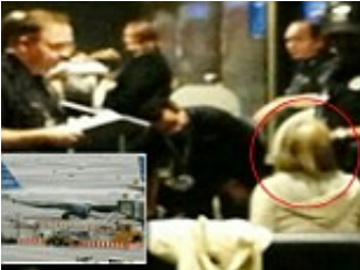
• Moment unruly lady first-class passenger, 42, was held by...