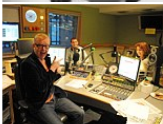
Good Evans! They said he'd never live up to Wogan or live...