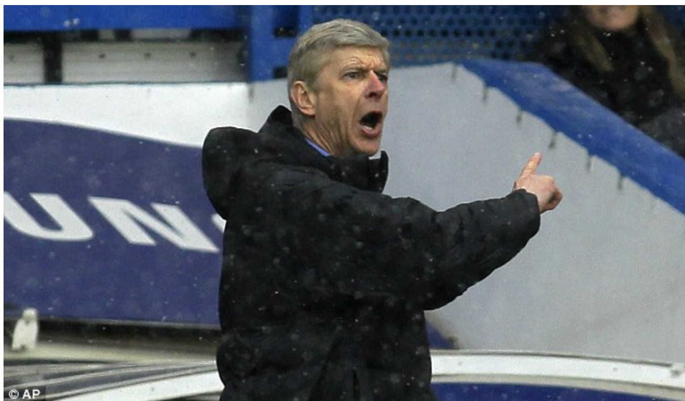
Where's my money? Arsene Wenger's players have strict rules to abide by at Arsenal's training ground

Ranging from between £100 to £1000, Wenger has ordered a list of offences to be drawn up and has signed it at the bottom. The list is hanging at the clubs training ground in London Colney.