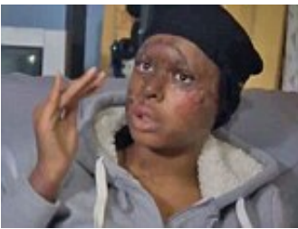
• 'I just wanted to die': Victoria's Secret worker who had...