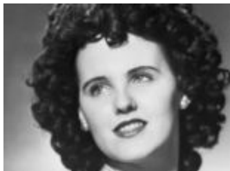
Could the infamous Black Dahlia case be about to be solved?...