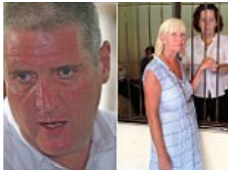
Firing squad granny in race against time to appeal after...